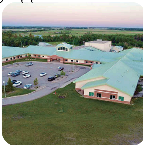
Southeast Integrated Care Centre